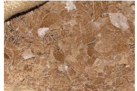
Figure 8- Edible oil cake Sesame oil cake