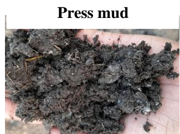
Figure 7- Industrial waste