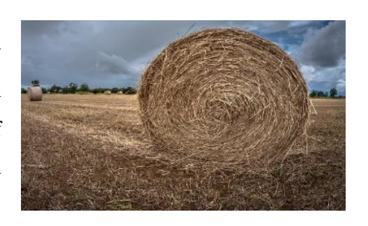
Figure 6 - Crop residue

The left-over stubbles of previous crop, straw and the by products such as bran, husk, groundnut haulms, cotton stalks can be considered as crop residue. About 50% of them is used for animal feed while the rest can be utilized for enhancing soil fertility and nutrient recycling