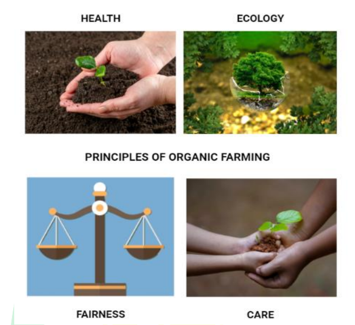
Figure 13- Principles of organic farming