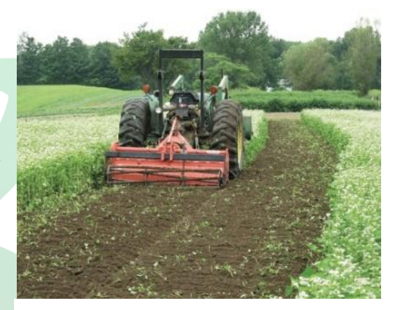
Figure 11- In-situ green manuring