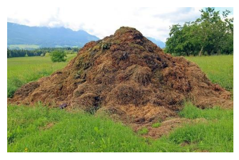
Figure 5- Farm-yard manure

Manures are the animal or plant waste that are used as a source of plant nutrients, the tied-up nutrients are released only after decomposition. Farm-yard manure is a decomposed mixture of dung, urine, bedding material of dairy animals