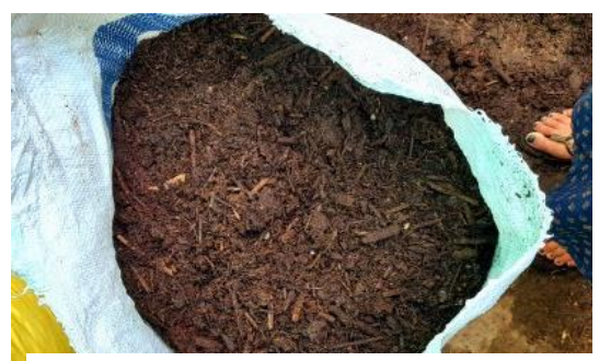
Figure 12- Green leaf manure