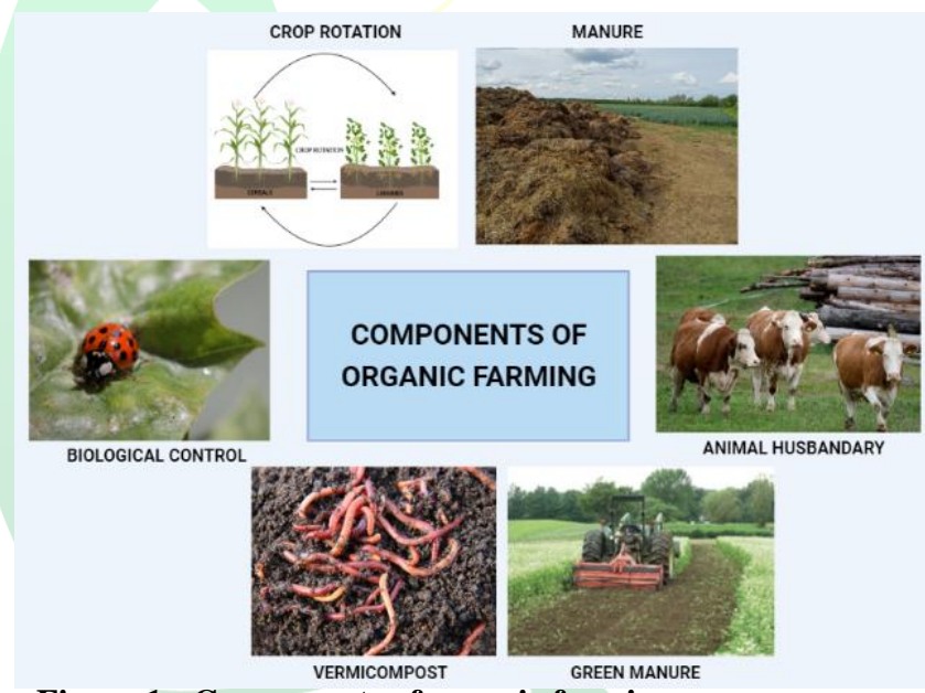
Figure 1 - Components of organic farming