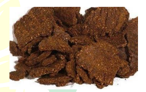
Figure 9- Non-edible oil cakes Castor oil cake